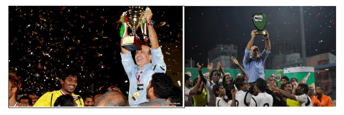
Titel 8: 2011 Maldiv Kupası