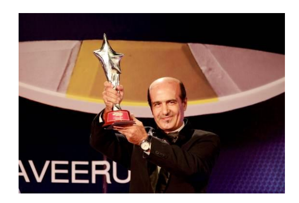
Titel 7: Coach of the Year 2011