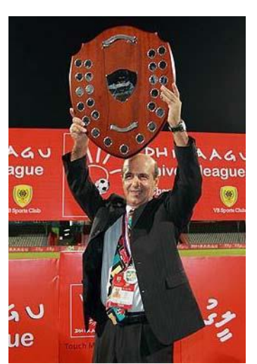
Titel 1: 2010 Lig Şampiyonluğu – Namağlup -