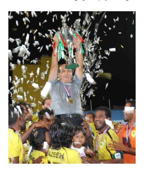
Titel 2: Başbakanlık Kupası