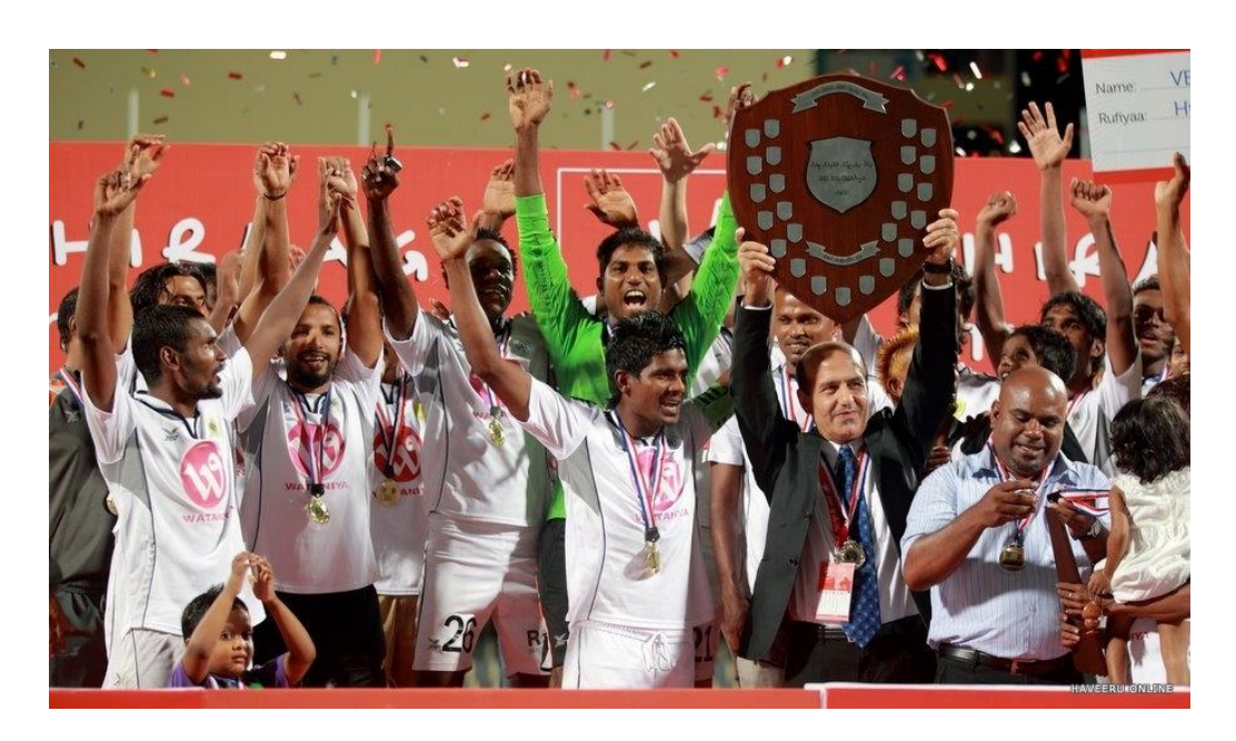
Titel 5: 2011 Lig Şampiyonluğu