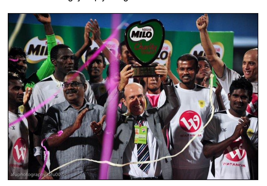
Titel 6: 2011 Süper Kupa