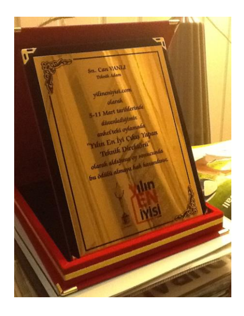
Turkish Media Award 2013 as "Successful Coach"