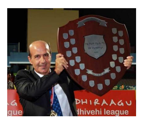
2011 Lig Şampiyonluğu