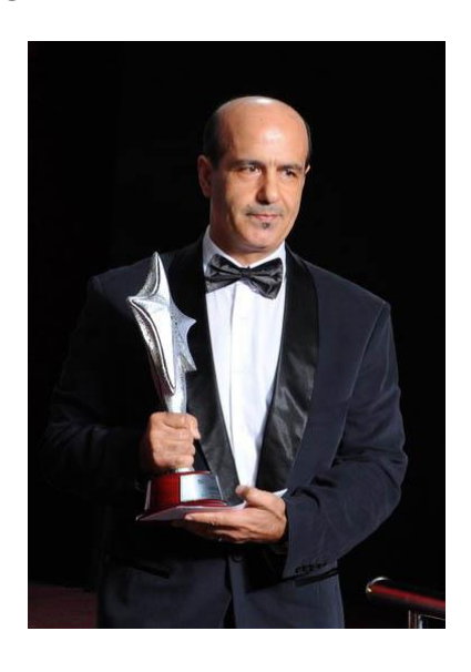
Titel 3: Coach of the year 2010