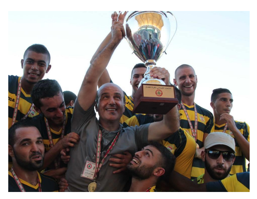
Titel 10: ELITE-CUP 2013