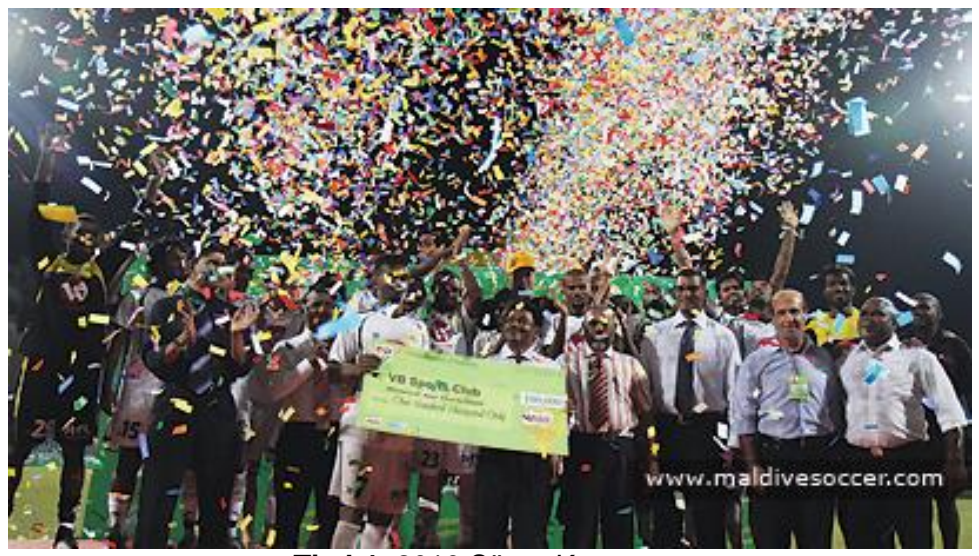
Titel 4: 2010 Süper Kupa